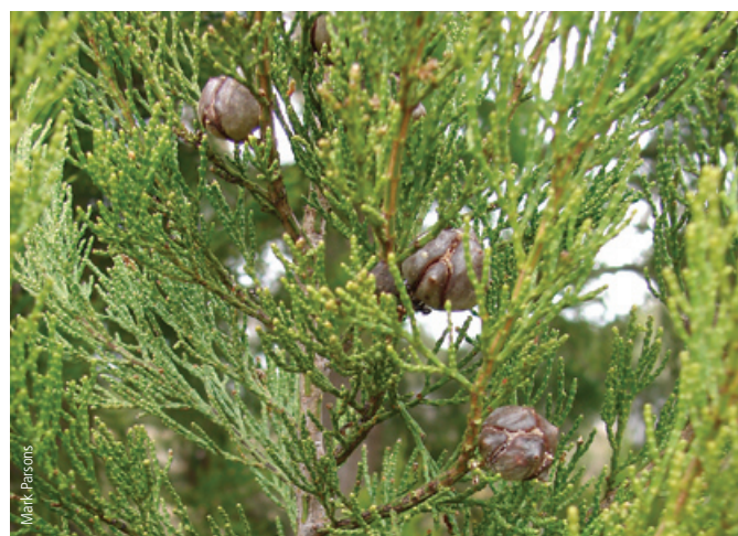
White cypress pine ( Callitris columellaris ).

Resin from the white cypress pine has been used as a substitute for sandarac resin, a raw material for specialist varnishes, and as incense. Blue cypress pine produces an oil suitable for aromatherapy; most production is derived from plantations rather than native callitris forests. Large areas of callitris forests are also used for grazing and beekeeping.