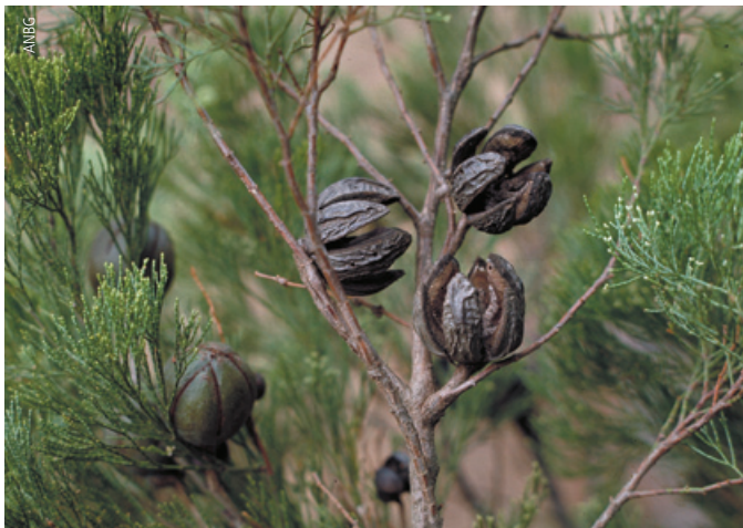
Rottne Island pine ( Callitris preissii ).