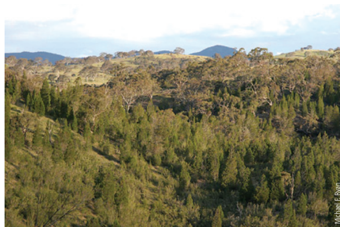
Black cypress pine ( Callitris endlicheri ).

Changes in fire frequency and land management since European settlement have allowed white cypress pine forests to expand in extent. Woodlands and open forests of white cypress pine and other callitris species grow in Queensland, New South Wales and South Australia. Tall open forests of Port Jackson pine ( C. rhomboidea ) grow in Tasmania and there are open forests of Rottneest Island pine ( C. preissii ) in coastal Western Australia and South Australia. Woodlands dominated by black cypress pine ( C. endlicheri ) and family pine ( C. verrucosa ) grow in localised areas in Queensland, New South Wales and the Australian Capital Territory. Callitris oblonga is the only member of the genus adapted to riverine habitats, but it can also grow on very dry sites.