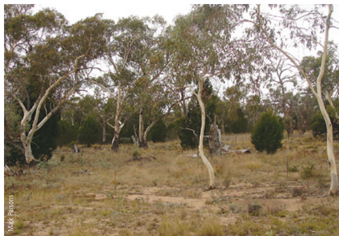
Callitris woodland with co-dominant eucalypts.

While callitris trees occur in association with many fire-tolerant species, they do not survive intense fire. When burnt, callitris regenerates from seed and will recover over decades, although it will disappear from sites altogether if fires occur too frequently or if grazing is excessive. Callitris species survive in Australia's fire-prone environment in areas protected from fire by the local topography and where the slow rate of fuel accumulation prevents frequent, high-intensity fires. Prescribed burning during the cooler months can lessen the risk of wildfires by reducing fuel loads in the forest.