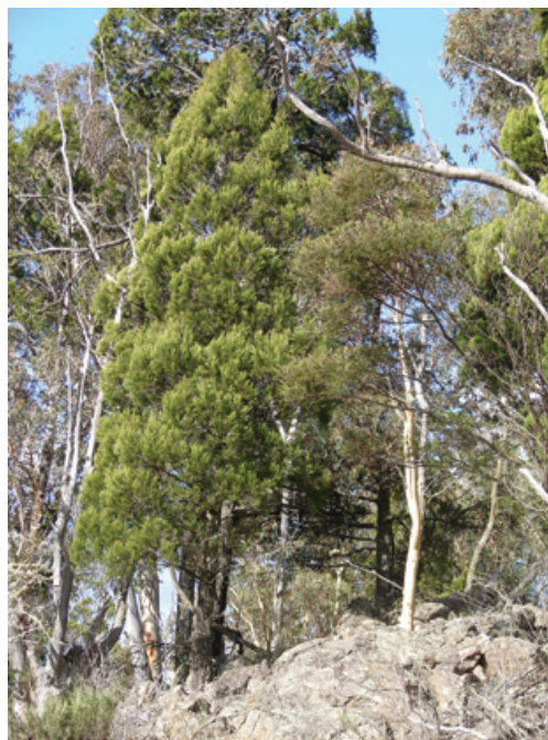
White cypress pine, Pilliga region, New South Wales.

www.hardwood.timber.net.au/species/cypresspine.htm