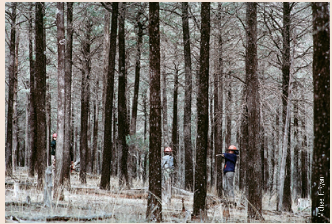
Assessing timber regrowth in a stand of callitris.

today. The 1950s regeneration and subsequent growth is being managed to provide a sustainable yield of timber into the future.