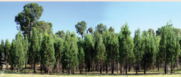
The dense regeneration of callitris that occurs in the absence of fire and grazing requires thinning in areas managed for sawlog production.

The cypress regeneration that occurred in the late 1800s forms the basis of the timber industry operating in the Pilliga