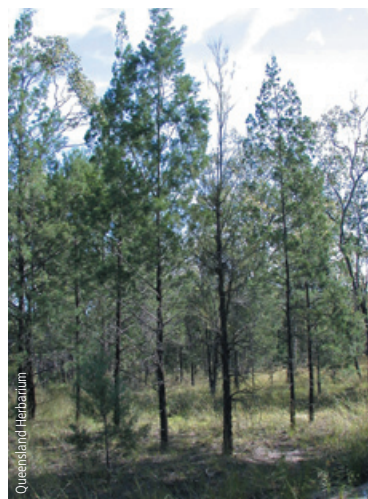
White cypress pine ( Callitris columellaris ) open forest, Queensland.

Table 1 shows that the total area of callitris forest increased by more than a quarter of a million hectares between 2003 and 2008 as a result of improved mapping and also a real expansion of the genus onto former grazing land. It also shows that more than one million hectares of callitris forest classified in 2003 in an 'unknown' crown cover class was reclassified in 2008 as either woodland or open forest. Callitris woodland is now known to occur on about 800 000 hectares and callitris open forest on nearly 1.8 million hectares.